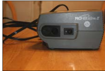
2. Put the nebulizer machine on a flat, steady surface