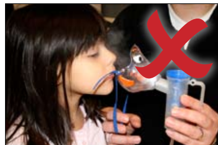
WRONG! Do NOT hold in front of face