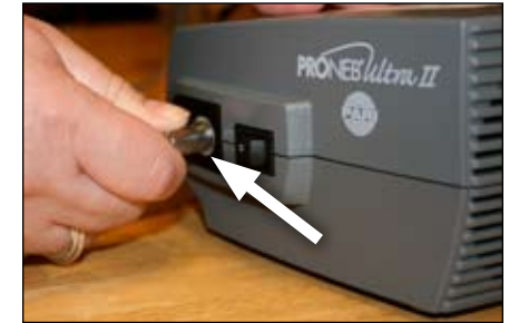
4. Connect one end of the tubing to the nebulizer