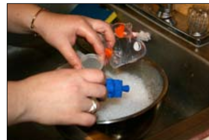
10. When finished, wash parts in soapy water and rinse