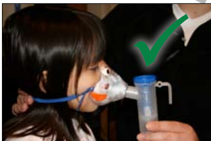
9. Place facemask over nose and mouth. Take slow deep breaths through your MOUTH