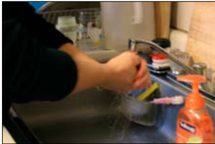
1. Wash your hands