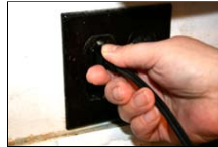
3. Plug into outlet