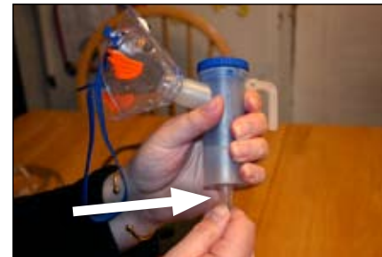
7. Connect the other end of the tubing to the medication holder