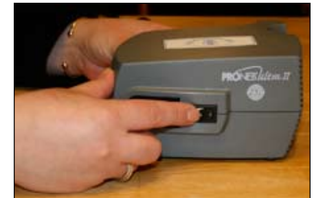
8. Turn on the nebulizer machine