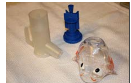
11. Allow parts to air dry