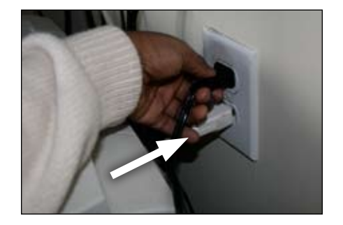
3. Plug into outlet