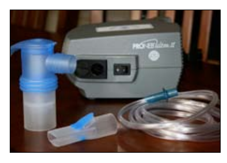
2. Put nebulizer machine on flat, steady surface