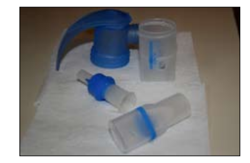
11. Allow parts to air dry